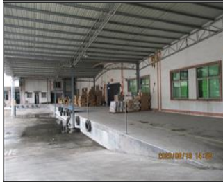
Photo of non-conformity Handrail for the delivery platform was not in use.JPG