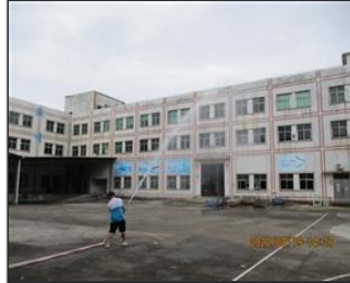
Photo of fire safety equipment Fire hydrant testing.JPG