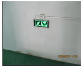
Photo of fire safety equipment Evacuation sign.JPG