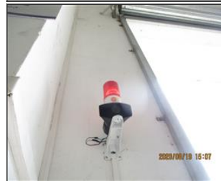
Photo of fire safety equipment Fire alarm flashing when tested.JPG