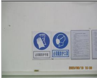
Photo of the personal protection equipments (if applicable) PPE warning signs.JPG