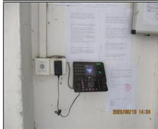
Photo of the inside of the main production hall Attendance recorder.JPG