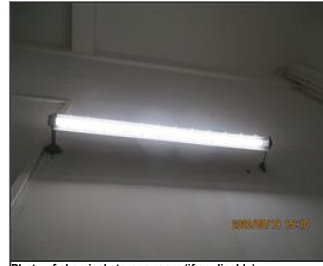
Photo of chemical storage room (if applicable) Explosion proof light.JPG