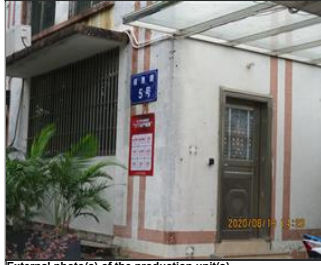
External photo(s) of the production unit(s) Factory address.JPG