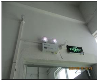
Photo of fire safety equipment Emergency light.JPG