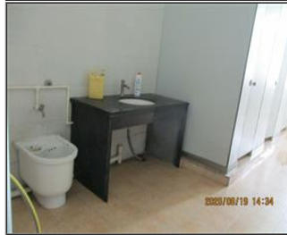
Photo of non-conformity No tissue and soap in toilet.JPG