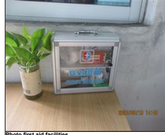
Photo first aid facilities First aid kits.JPG