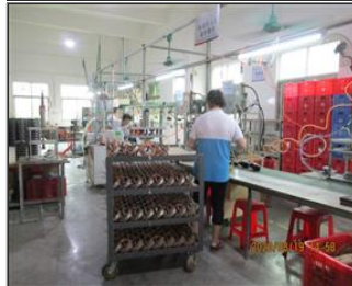
Photo of the inside of the main production hall Motor assembling line.JPG