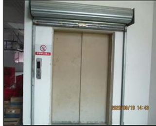
Photo of the inside of the main production hall Elevator.JPG