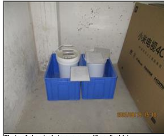
Photo of chemical storage room (if applicable) Chemical warehouse.JPG