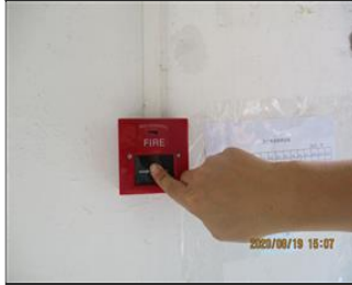
Photo of fire safety equipment Fire alarm testing.JPG