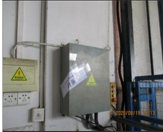
Photo of the inside of the main production hall Electrical box.JPG