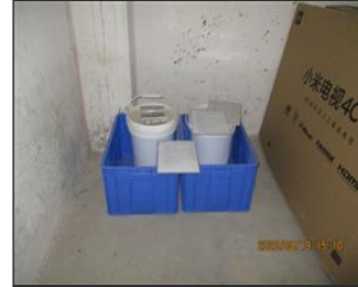
Photo of non-conformity Chemical missing safety label.JPG