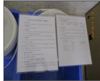
Photo of non-conformity Only 10 items in MSDS.JPG