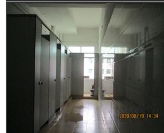
Photo of the sanitary facilities Toilets.JPG