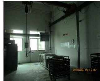
Photo of the inside of the main production hall Paint dipping.JPG