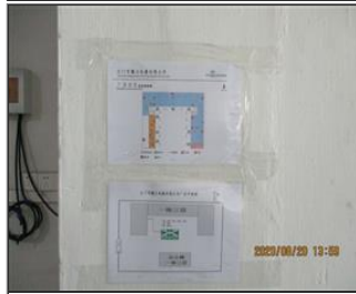
Photo of fire safety equipment Evacuation plan.JPG