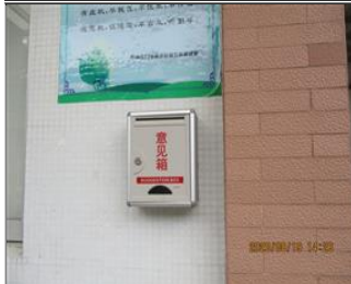
Photo of the inside of the main production hall Suggestion box.JPG