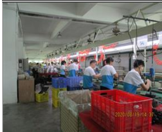
Photo of the inside of the main production hall Assembling and packing line.JPG