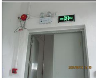
Photo of fire safety equipment Fire alarm and exit sign and emergency light.JPG