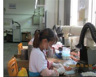
Photo of non-conformity Tin-soldering worker wearing disposable mask instead of disposable mask.JPG