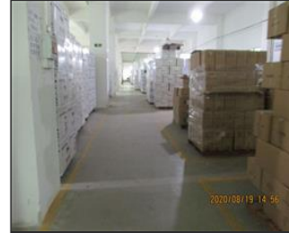
Photo of the inside of the main production hall Finished goods warehouse.JPG