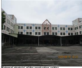
External photo(s) of the production unit(s) Product building.JPG