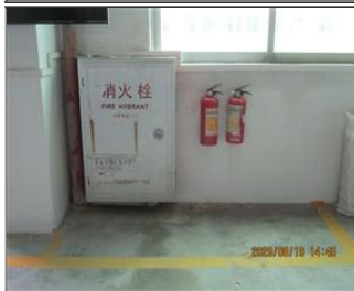
Photo of fire safety equipment Extinguishers and fire hydrant.JPG