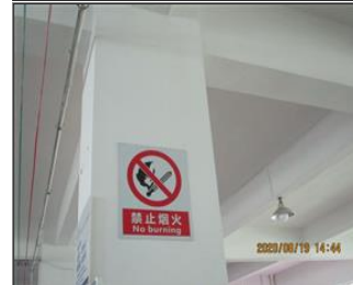
Photo of the inside of the main production hall Warning sign.JPG