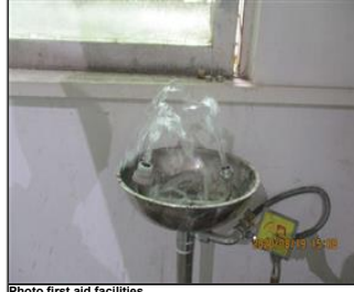
Photo first aid facilities Eye washing facility.JPG