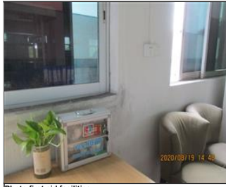
Photo first aid facilities No emergency plan posted onsite.JPG