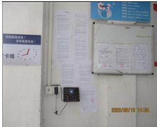
Photo of the code of conduct on display amfori BSCI code of conduct.JPG