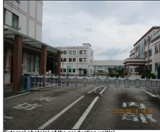
External photo(s) of the production unit(s) Factory gate.JPG