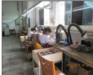
Photo of the inside of the main production hall Tin-soldering.JPG