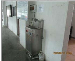
Photo of the sanitary facilities Potable water.JPG