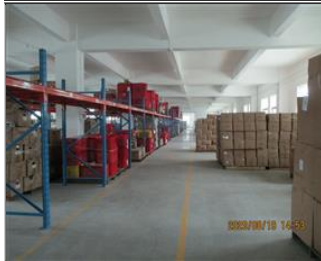
Photo of the inside of the main production hall Material warehouse.JPG