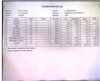
Photo of non-conformity Social insurance only provided for part of employees.jpg