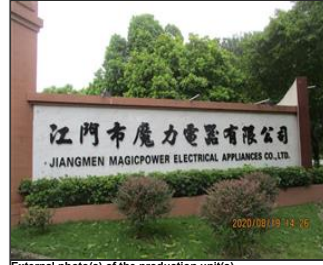
External photo(s) of the production unit(s) Factory name.JPG